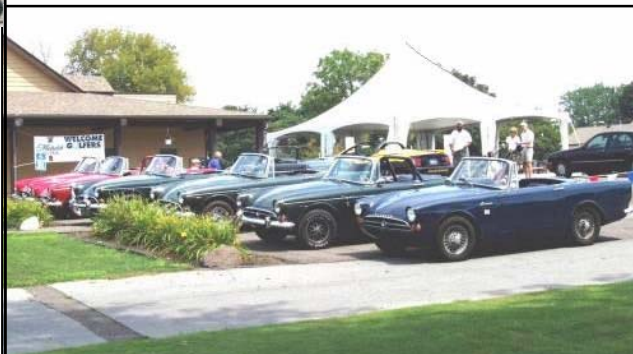
The Sunbeams attracted a lot of attention, especially from the golfers at the course.

We had no car problems during the day and, as far as I know, everyone safely found their way home.