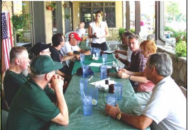
Orders being taken on the shaded porch overlooking the Detroit River

Unfortunately it received some damage when it got loose in the shipping container on the way over.