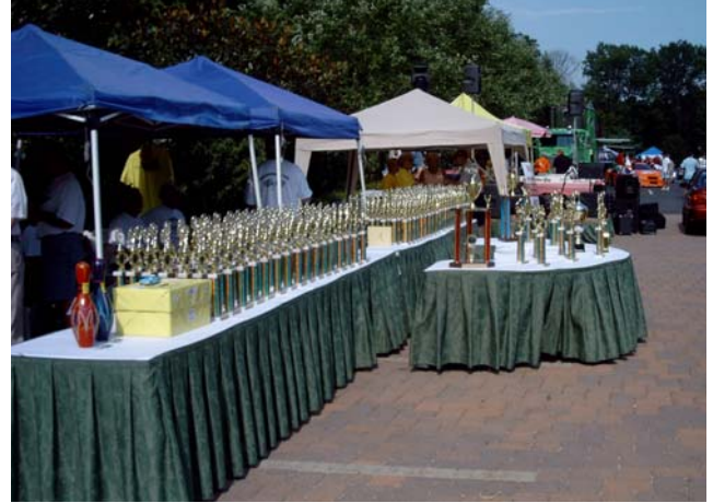
The trophy table at the Two Kids Foundation car show. See page 10