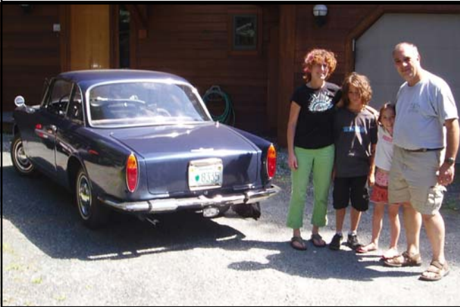
The Reina family with their new acquisition